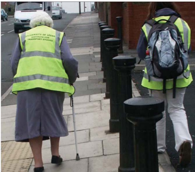
An accompanied walk

The Department for Transport requires all local authorities to map the extent to which different groups in their population have access to a range of key services such as supermarkets, health care and employment sites. This is known as accessibility planning. The approach to identifying problems during accessibility planning can initially be mechanistic – consisting of plotting areas that are poorly served by buses and trains with respect to journey time or cost to a number of 'key services'. This type of planning may not accurately represent the real-life situations faced by older people when moving around their local area.