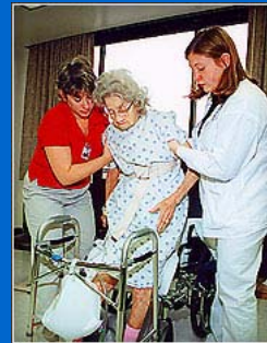
Caring for an older patient with hip fracture

The knowledge gained from this research will help guide best practice in preparing an effective integrated care pathway in the collaborating NHS hospital. It may also lead to improvements in patient outcomes and satisfaction, such as the potential for survival, recovery and independence after the fracture.